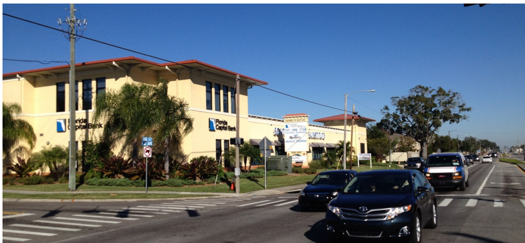
High Visibility Location with Excellent Signage

8200 66th ST., N, Pinellas Park, FL 33781