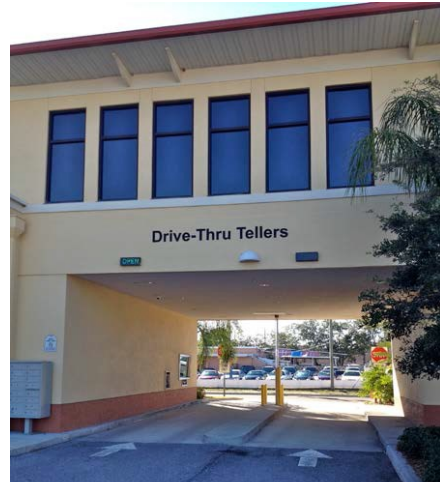
2 Drive-Thru Lanes