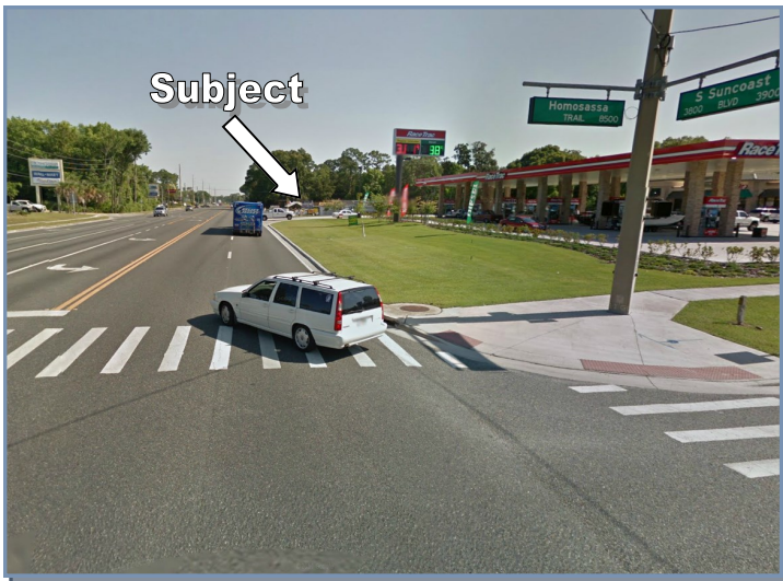
Street View North