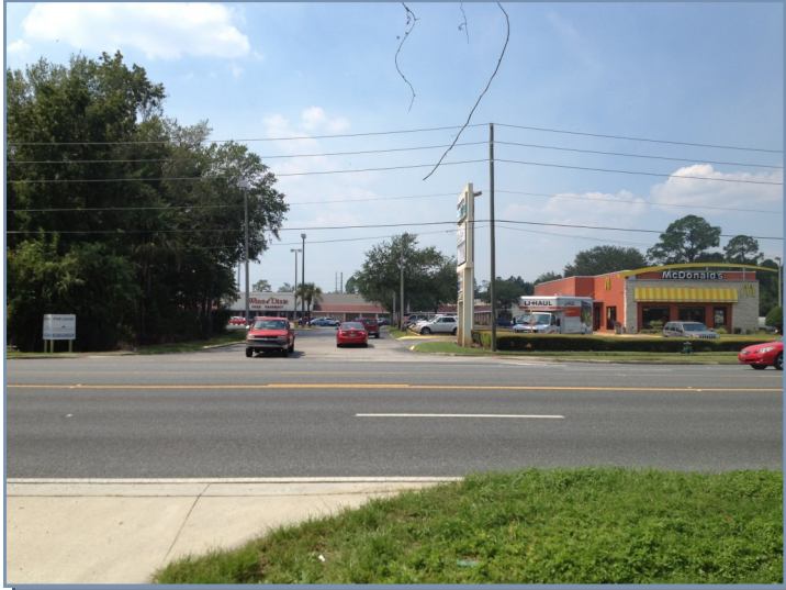
Street View West

2.5 Acres US-19 Homosassa Suncoast Blvd., Homosassa, FL 34448