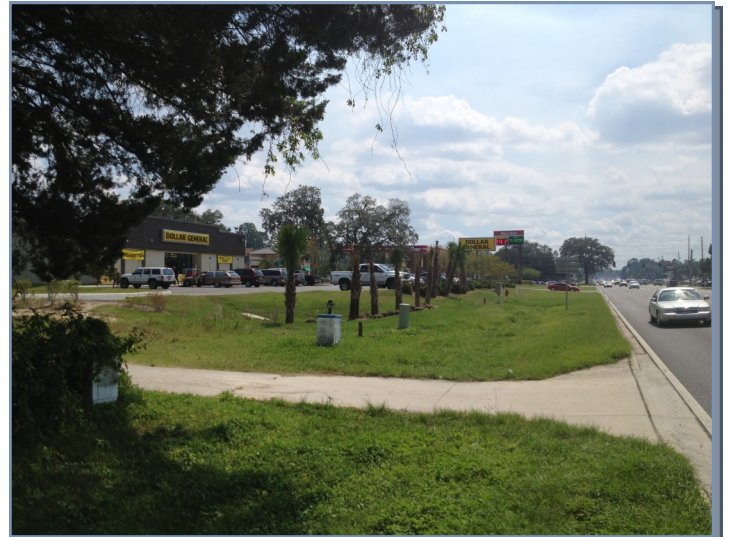
Street View South