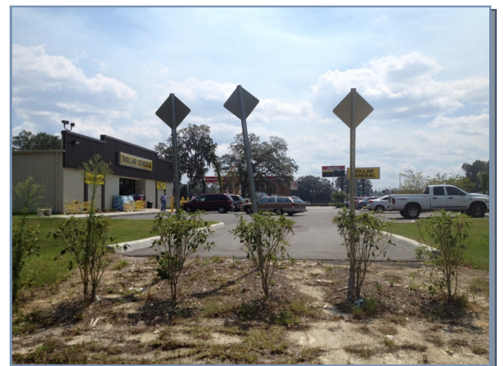
Access Via Dollar General and Racetrac